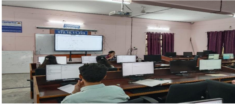
27-03-2024, 9:20 AM – 12:40 AM (IT &CSE: Room No.1012)