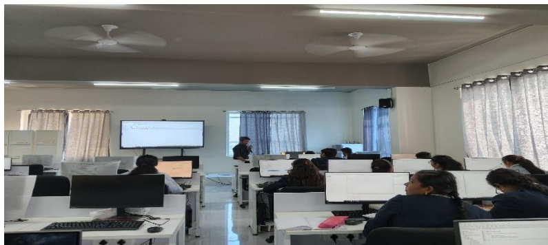
27-03-2024, 9:20 AM – 12:40 PM (IT: Room No.7312)