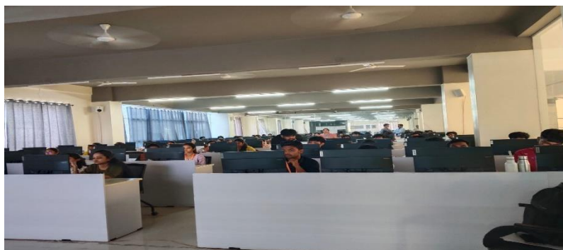
27-03-2024, 1:20 PM – 4:30 PM (ECE: Room No. 7111)