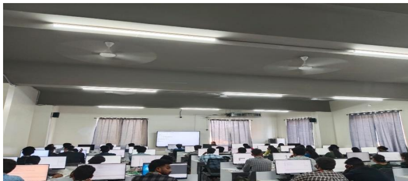
27-03-2024, 1:20 PM – 4:30 PM (ECE: Room No. 7110)