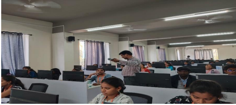
27-03-2024, 1:20 PM – 4:30 PM (ECE & CSG: Room No. 7112)