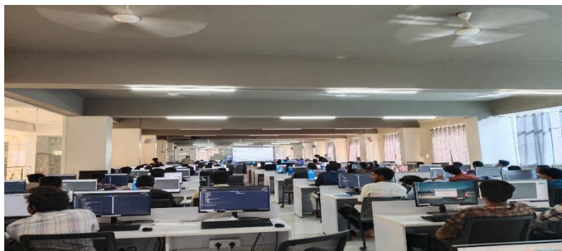
27-03-2024, 9:20 AM – 12:40 PM (CSE: Room No.7111)