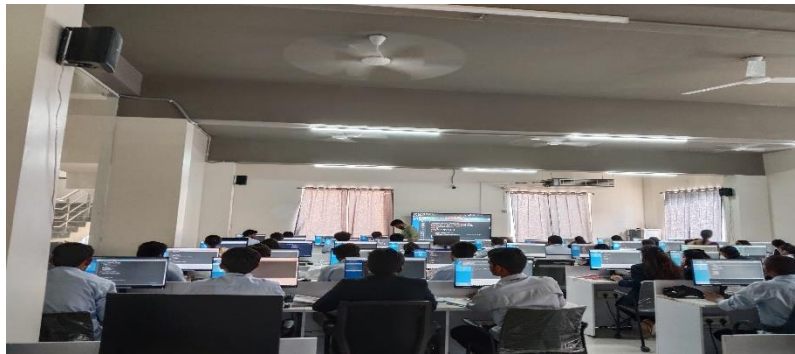
27-03-2024, 9:20 AM – 12:40 PM (AI&DS: Room No.7110)