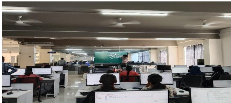
27-03-2024, 9:20 AM – 12:40 PM (CSE: Room No.7112)